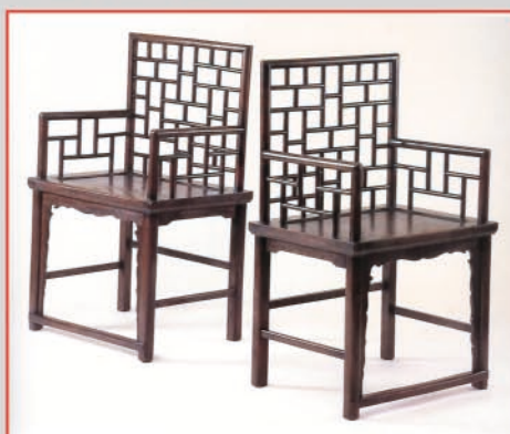
Mid-Qing Pair of Rose Chairs, Chinese Walnut 61 x 47 100cm overall height

It isn't known exactly when the term 'rose chair' first appeared in Chinese carpentry, nor why such a name was given to this type of linear-style, low-back armchairs.