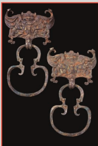
Warring States period (475 - 221 B.C.) A pair of bronze door knockers

This picture shows a pair of door knockers done in gilt bronze with inlaid of silver and gold. The Taotie (mythical face) has a figure of wuren.