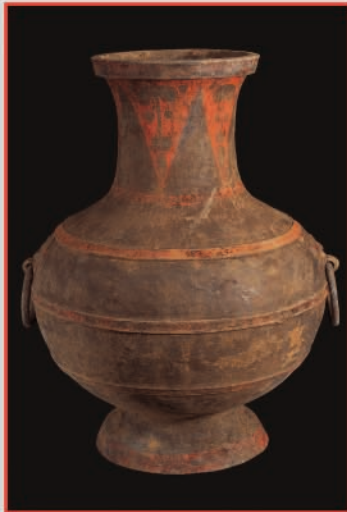
Han Dynasty (206 BC - 220 A.D.) 52 cm in height

A finely painted grey pottery vase with the decoration of taotie mask holding a ring on each side of the body.