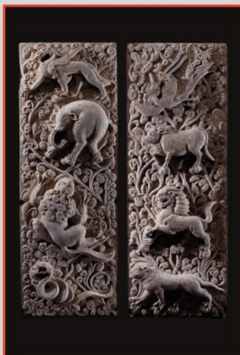
Song Dynasty (960-1279 A.D.) Grey stone carved panels L.37cm x H. 97cm x D. 9cm

A pair of carved panels featuring the auspicious animals.